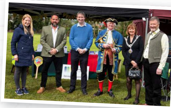
Contest in 2023 for a new Knaresborough town crier