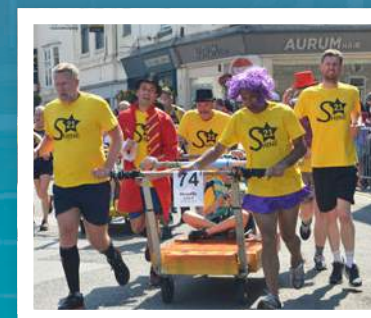
Last year's race