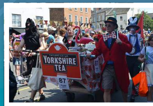
Teams dress to match their beds