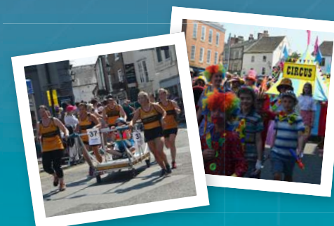
Fantastic fun for the whole family

The Parade can be viewed at the Castle, Market Place, High Street, Bond End and Conyngnam Hall Field. The Race starts at Conyngnam, goes across High Bridge and along Waterside through the Gorge. Teams run up Castle Ings, go around the Market, down the High Street, across High Bridge to McIntosh Field. The River Crossing returns them to where it started. Comfortable shoes are a must and don't come bar' t'at. There is a map in this programme on page 9.