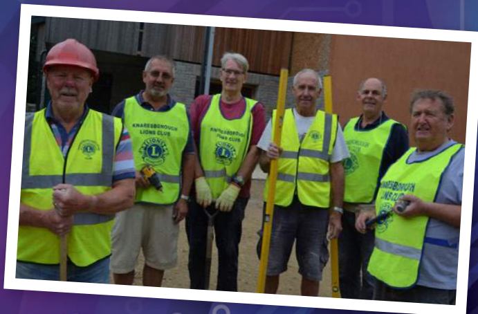
A team of Lions are helping to renovate the Guides Centre at Birk Crag

Bed Race, a volunteer-organised community event, has been staged to raise funds for charitable purposes since its very beginning in 1966.