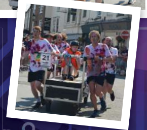
Dashing through the town