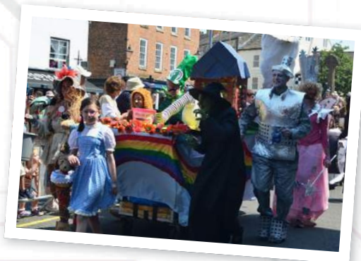
The 2023 Parade of Dressed Beds