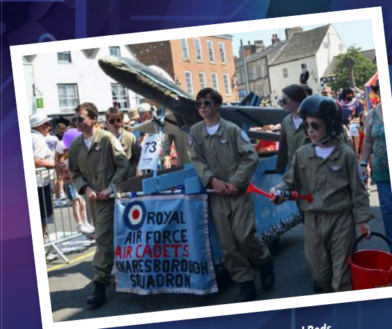
The 2023 Parade of Dressed Beds

We aim to have the event done and dusted, the roads opened, the crowds dispersed, teams to take up their beds and head home. The organisers and our helpers now tidy up for another year.