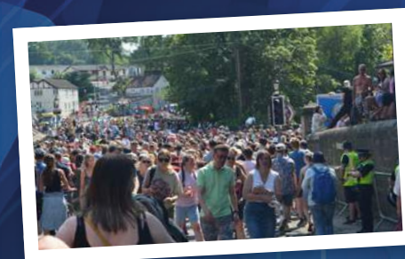
Huge crowds at Bed Race in 2023

And of course, the wonderful people of Knaresborough!